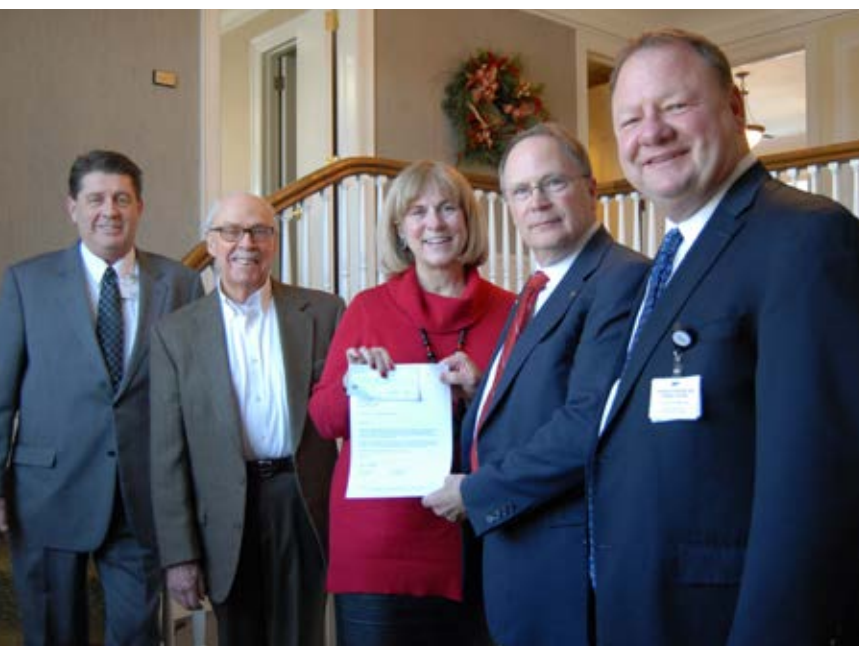
LEFT The Werth Family Trust will impact people for years to come through their planned gift.